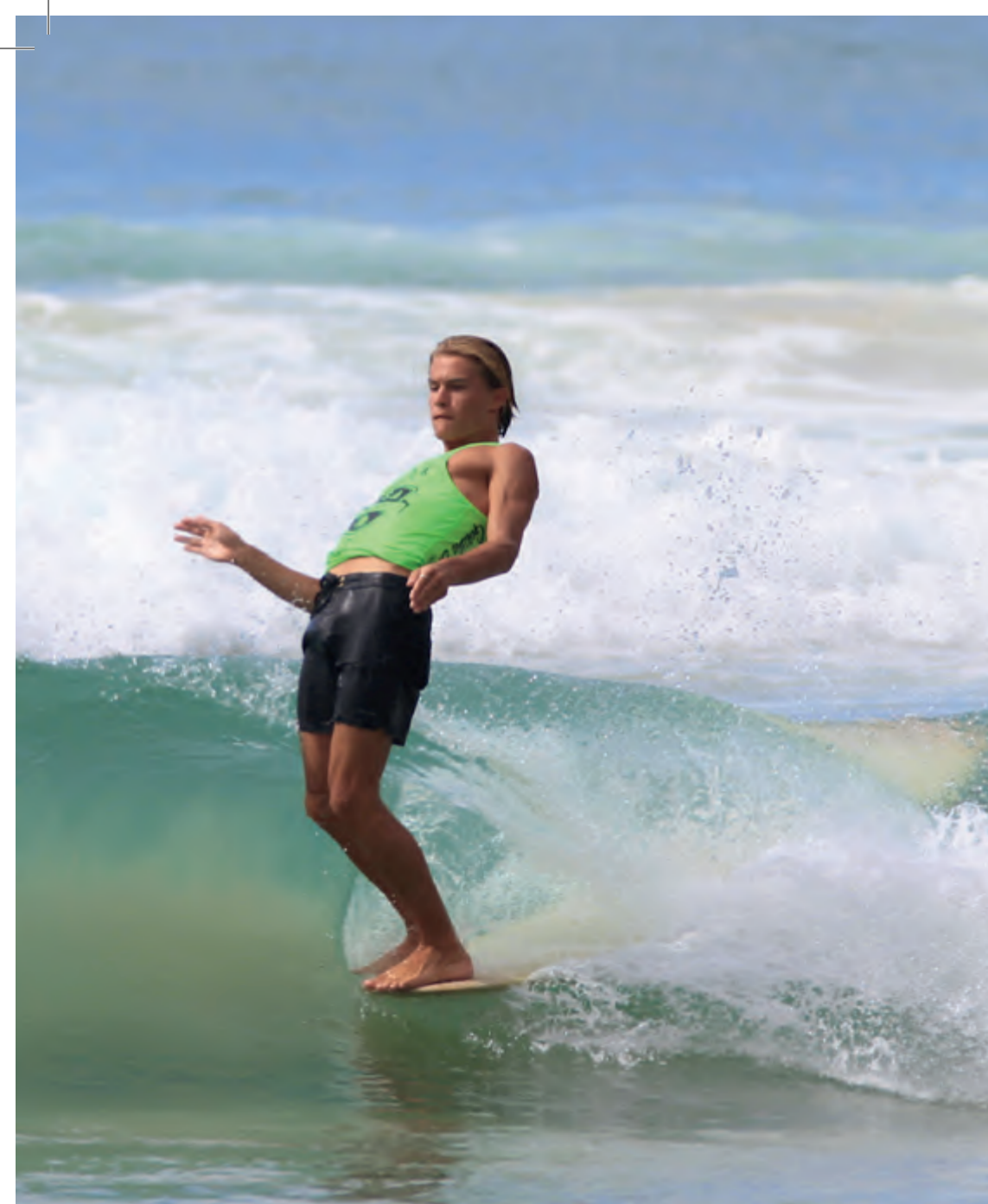
Noosa Festival of Surfing