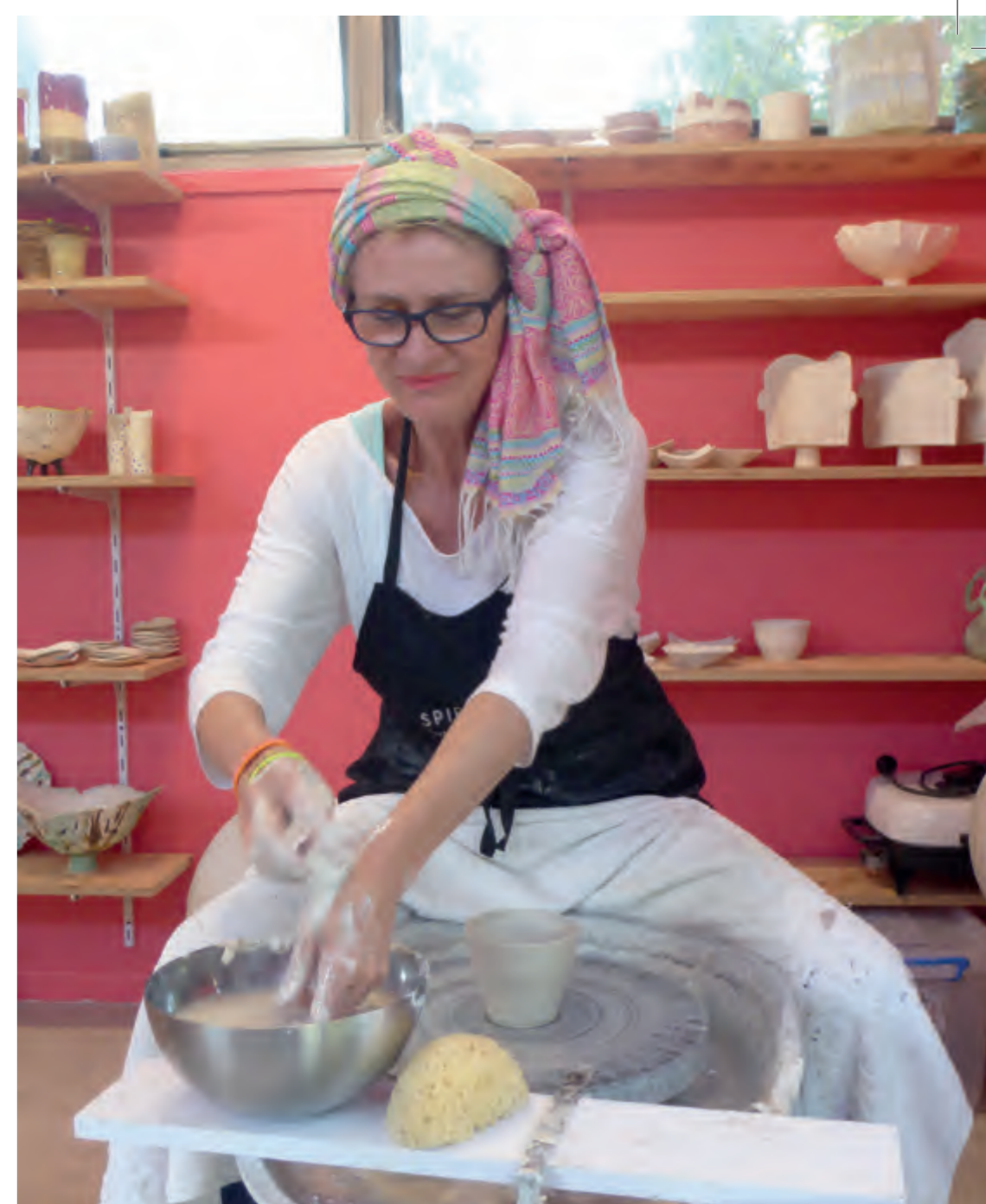
Noosa Open Studios