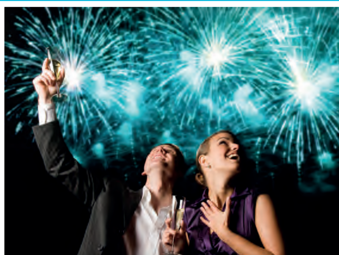
New Year's Eve fireworks