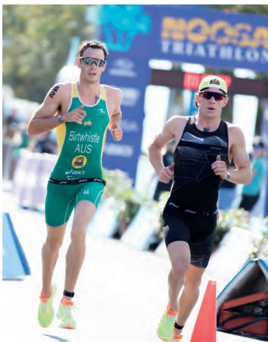
Noosa Triathlon Multi Sport Festival