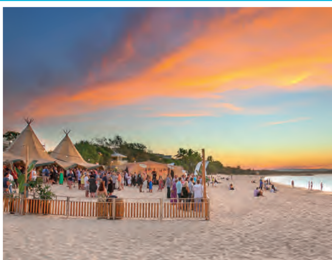
Noosa Food & Wine Festival