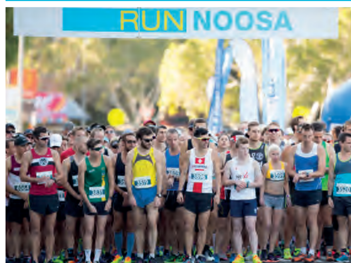
Noosa Ultimate Sports Festival