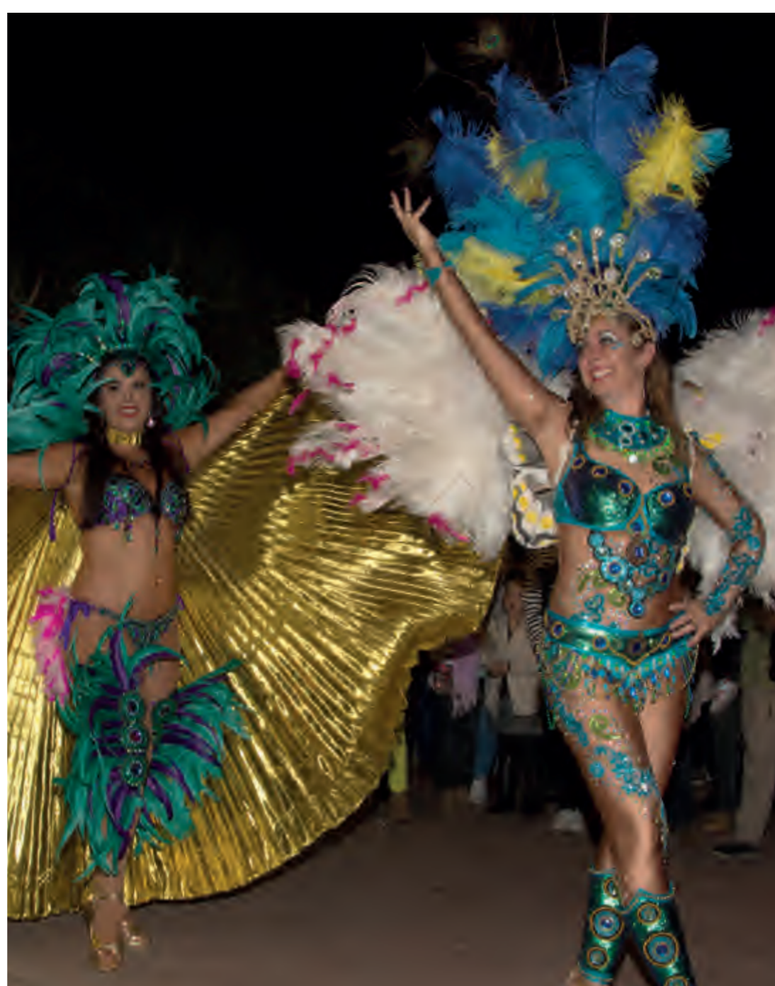
Noosa Long Weekend Festival